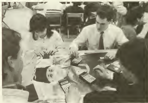
Some of last year's JETS-TEAMS competitors.